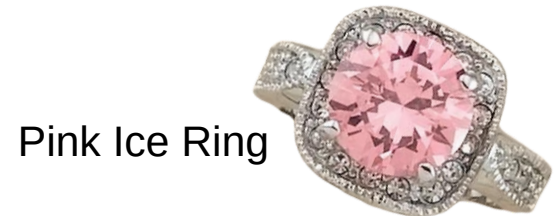
Pink Ice Ring

Add 3 team members who place their first order.