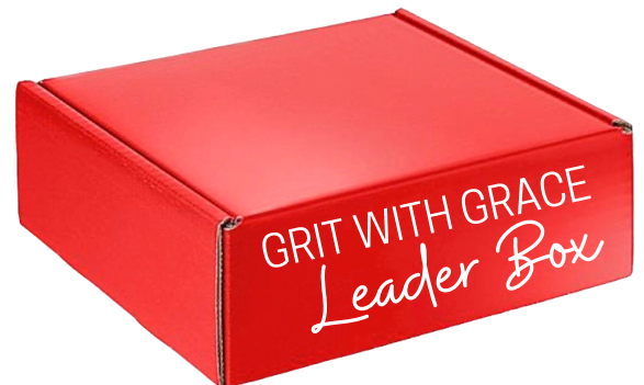
Grit with Grace Leader Box